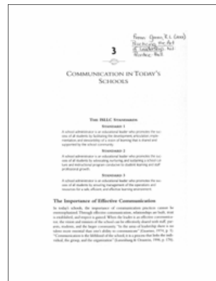
Your course packet after digital re-mastering.