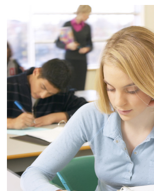
A single customized reader can be more cost-effective for students than purchasing multiple textbooks.

This benefits students by keeping them current with real world information and holds their attention better than standard information from an